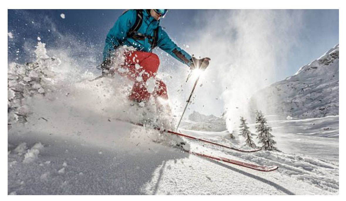
SKI SEASON IS WINDING DOWN