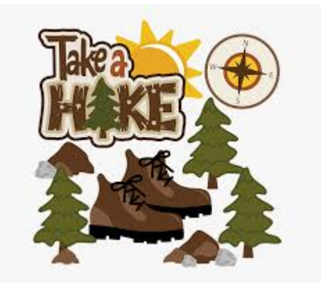
Fire Tower Hike Series