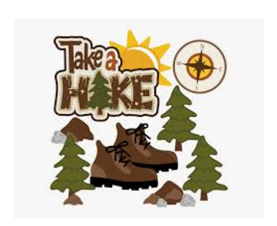
Fire Tower Series

The DEC's Fire Tower Challenge encourages hikers to visit the 6 remaining fire towers in the Catskills. The challenge involves visiting all towers between January 1, 2023, and December 31, 2023. You do not need to climb up to the cab which are typically open when staffed by volunteers between Memorial Day and Columbus Day on weekends.