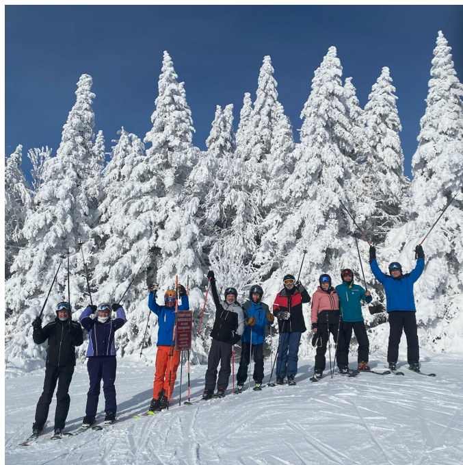
Photo below of part of the TSSC contingent on top of Mt. Tremblant (NJSSC Trip) on January 30. A beautiful, sunny day with plenty of snow cover in most areas - including the glades, reasonable temperatures, good conditions and great camaraderie.

For those of you who typically participate, the 2024 races at Hunter will be held on Monday February 5 and Sunday March 3.