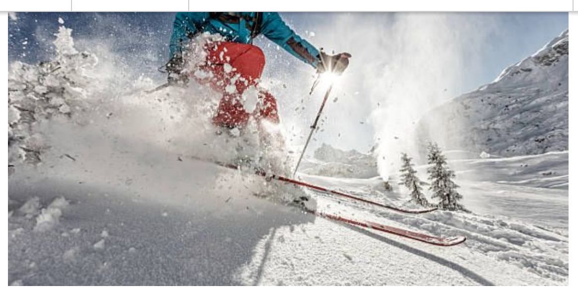
SKI SEASON IS WINDING DOWN