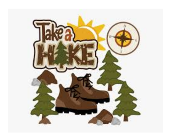
First Hike of the Spring season.

Wednesday May 8, 9:00 am Shaupaneak Ridge, 143 Popletown Road Esopus, NY.